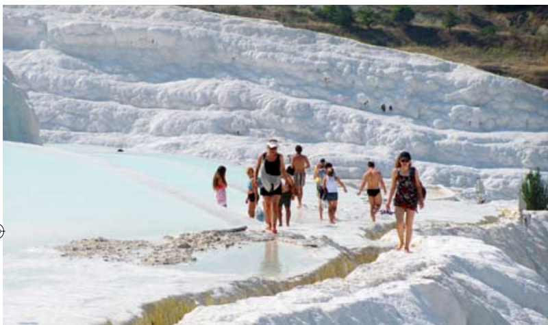
Limestone terraces with travertine pools in Pamukkale

The town of Pamukkale, located 12 miles (20 km) outside of the region's major city, Denizli, is situated at the base of the travertine cliffs that have become one of Turkey's top sights. Another major attraction on the hill above is the ancient site of Hierapolis, which translates as "sacred city." The thermal waters of this site are deemed healing, and consequently attract thousands of international tourists and locals alike.