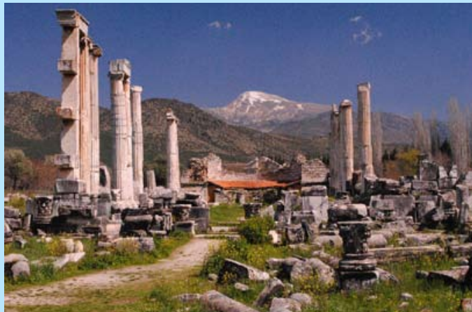
Aphrodisias is named after its Temple of Aphrodite.

Excavations have uncovered ancient Greek settlements all across Turkey, particularly in the Anatolian area. The following are some of western Turkey's most prominent ancient sites open to explore. Find ancient Greek coins at Miletus, the Great Altar of Zeus at Pergamum, and imposing, sculpted stone heads at Didyma and Aphrodisias.