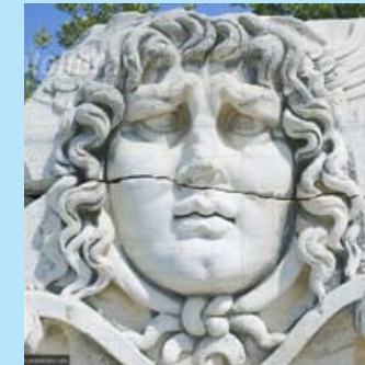
The famous head of Medusa at Didyma, dates from the 4th century B.C.

The ancient city's most important structure is the Temple of Aphrodite (late first and second centuries A.D.): It was here that the local goddess Aphrodite of Aphrodisias was worshipped. However, Aphrodisias' stadium is surely the most breathtaking of the site's ruins. Its long, slender ring of 22 rows (30,000 seats) patchy but entirely intact, the stadium measures a grandiose 860 x 194 feet (262 x 59 m), larger even than the original Olympic stadium in Greece.